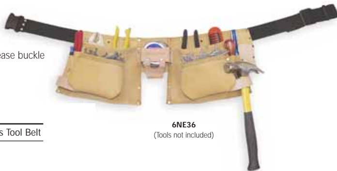
6NE36 (Tools not included)