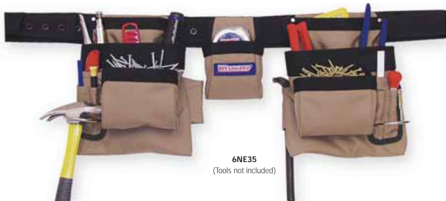
6NE35 (Tools not included)