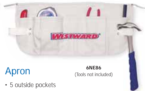
6NE86 (Tools not included)