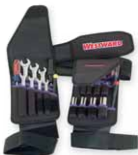
3LY94 (Tools not included)