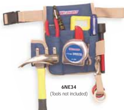
6NE34 (Tools not included)