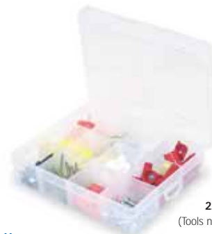
2ZY17 (Tools not included)