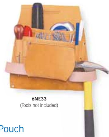
6NE33 (Tools not included)