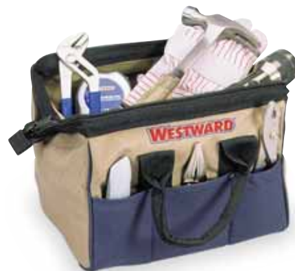
5XV46 (Tools not included)