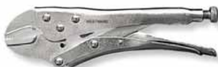
10" curved jaw