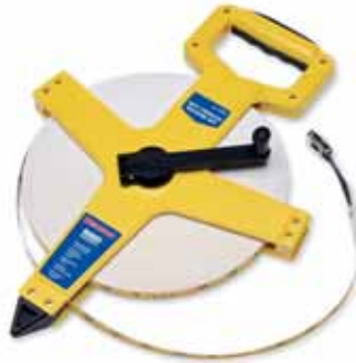
1CNY4, 1CNY5, 1CNY6, 1CNY7, 1CNY8